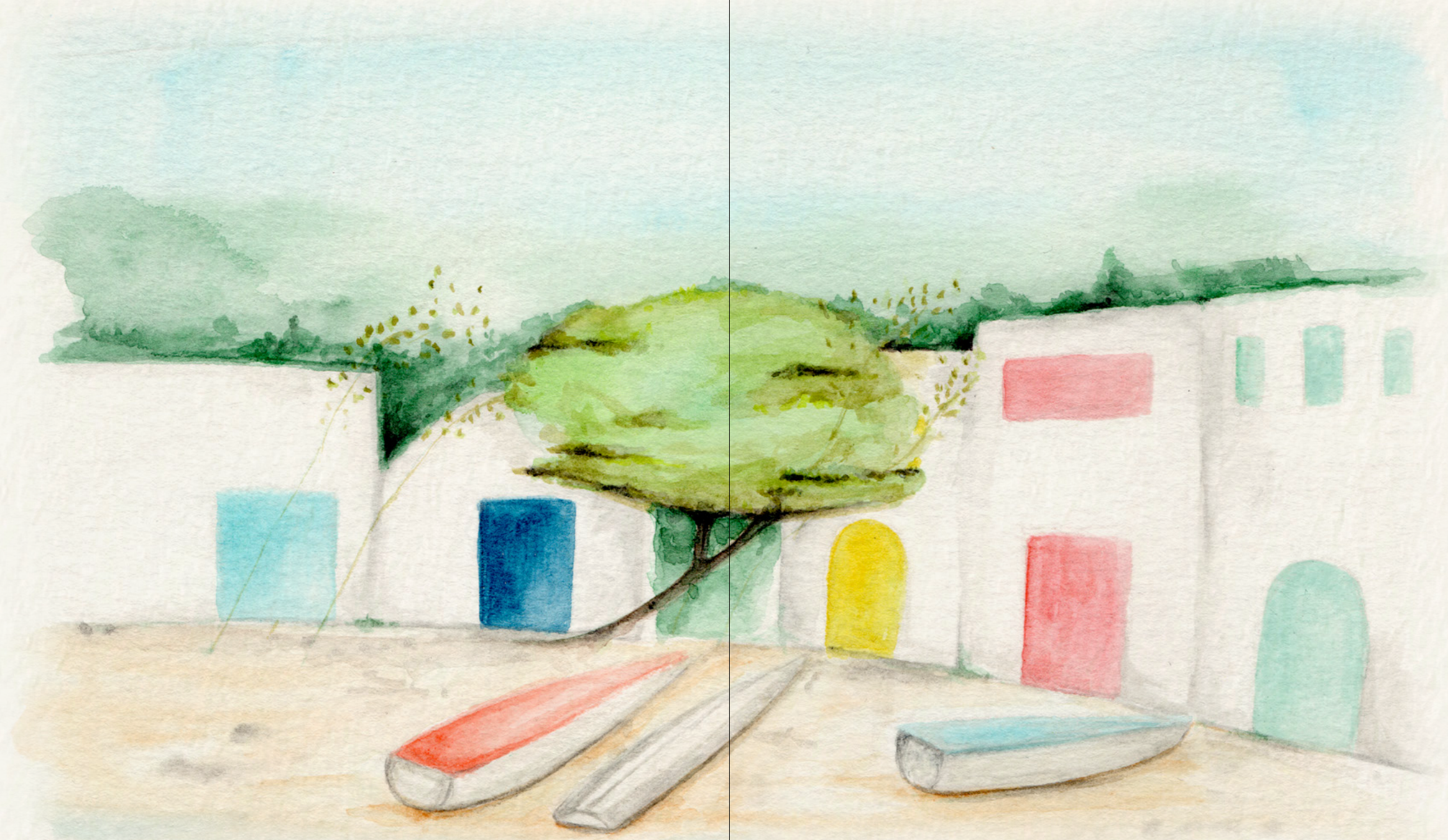
Cala S'Alguer (Costa Brava)

WATER, LAND AND PEOPLE THAT GENERATES MOMENTS AND FEELINGS